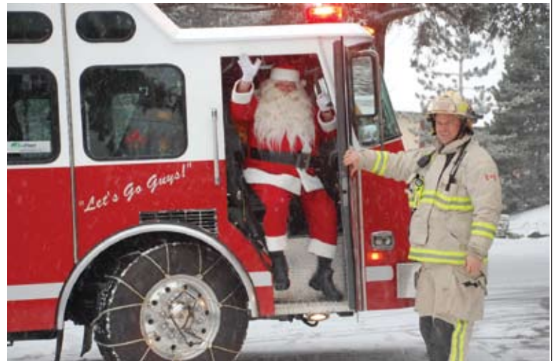
Santa Arrives at Mahon Hall for last years' Meet Santa event.

Around the world there are many ways to celebrate the holiday season and for millions of people, traditions include the making of fine crafts. Crafts can be a productive, peaceful refuge from the crush of holiday parties and the pressures of the season.