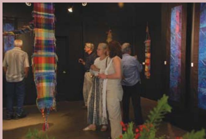
Textile Showcase - 'Voice in Three Strands, July 2008

Prepare to be part of the process in the upcoming year. As we discover the contentment of creating, building and working together - we also find the world a richer place.