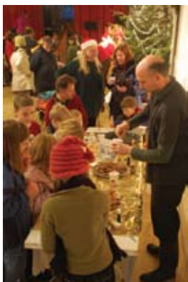
Cookie Making was popular at last year's Meet Santa Event.

Visualize A Simpler Life - make a list of things you spend too much time, energy and money on. Then make a list of things you wish you could do, have or be. Imagine ways to create your authentic life ~ one that will bring you the most joy.