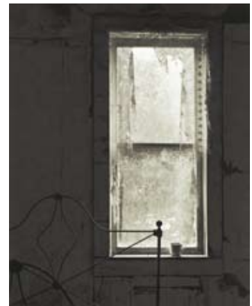
The cup is Always Half Full by Russ Kwan

One of my favorite shots is a compositionally bisected print, an image of a paneled wooden door on the right, visually balanced by the 'paneled' light reflected on the wall behind it as seen through a mullioned window. This, to me, represents an aesthetically cunning dichotomy of composition and meaning. Transparent/Solid. Light/Dark. Disparate/Same. This use of device, technique and skill in printing along with cleverly arranged imagery are